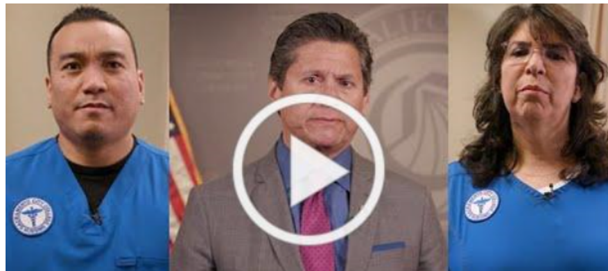
California Community Colleges: Our Response to COVID-19 and Health Tips on How to Protect Against It

throughout our state and the world. During this public health emergency, the California Community Colleges' number one priority is to ensure the safety of all of our students and staff across our 115 colleges. Learn more about what we're doing to support our colleges, convert from in-person classes to an online environment and hear valuable tips from community college nursing students on how you can protect yourself and others.